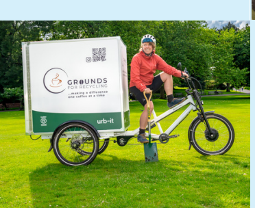
The Glasgow Business Narrative