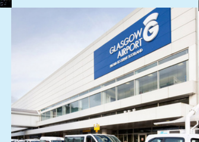
Net Zero and The Green Investment Prospectus