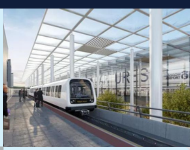
Glasgow (Clyde) Metro

Glasgow Chamber is focused on driving the delivery of these projects forward for our city.